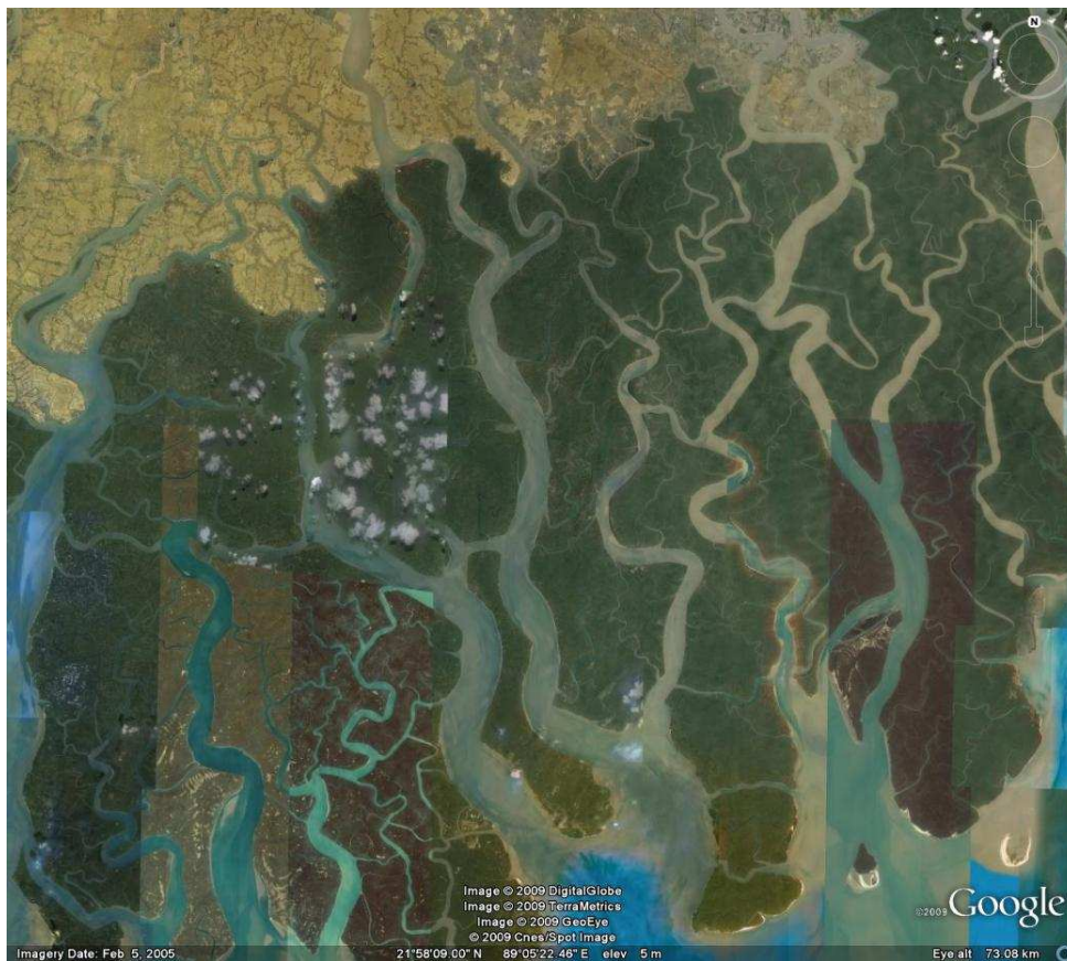
GoogleEarth image of part of the Sundarbans

1860s after the establishment of a Forest Department in the Province of Bengal, in India. There are approximately 2.5 million people living in the small villages on the edge of the Sundarbans. The national park area provides a livelihood at certain seasons of the year for an estimated 300,000 people, working variously as woodcutters, fishermen, and gatherers of honey, golpatta leaves and grass. Fishermen come in their boats from as far away as Chittagong and establish temporary encampments at various sites along the coast, where they remain until the approach of the monsoon season in April before returning to their homes. The Sundarbans is now a World Heritage Site, extending across the southern coasts of India and Bangladesh. A UN Development Programme project on Bio-diversity Conservation in Sundarban – a two-country approach was prepared in 2003-4, but has not been implemented to date.