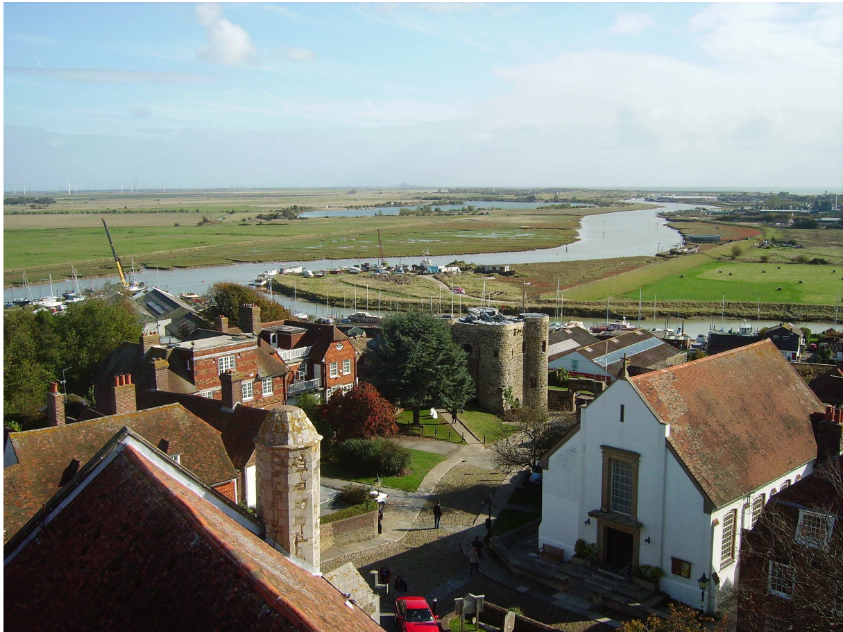
View of Romney Marsh from Rye Church