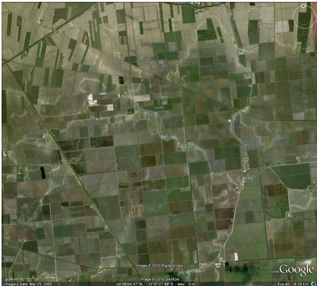
GoogleEarth grid-like fields and straight canals overlying relict water channels in the Po Delta

including archaeological sites, towns and villages, churches, castles, villas and farms, buildings linked to the land reclamation activity, salt pans, and navigable channels.