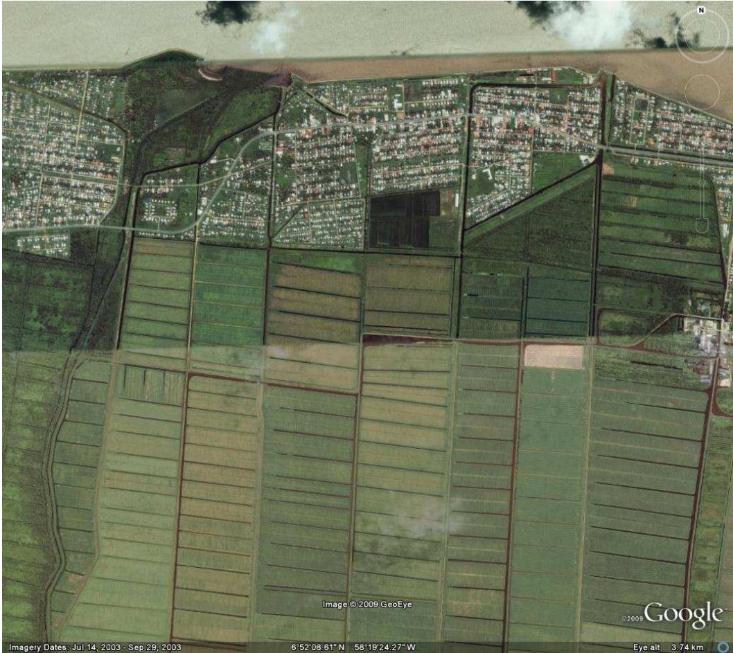
GoogleEarth image of the Essequibo plantation strips and drainage channels

hunting and fishing economy. The first European settlers were the Dutch, with the Dutch West India Company establishing the Essequibo colony in 1621. This was a trading-post 25km upstream on the Essequibo River, other settlements followed, usually a few kilometres upstream on the major rivers. Initially the intention was to trade with the indigenous people, but soon changed to the acquisition of land. Between 1655 and 1680 a sea wall was built to reclaim land from both the sea and the freshwater swamps. An interlaced network of drainage channels was constructed and at the seaward end kokers (culverts/sluice gates) were installed allowing the land to be drained at low tide. Plantations were laid out in strips running inland and a dam and network of irrigation canals built to supply water for the farmland and settlements. The labour for the construction and maintenance of these plantations was provided by imported African slaves. The British took over the rule of Guyana in 1796 and it remained in their hands until independence in 1966. Today more than 90% of Guyana's population live on the coastal plain and the investment in drainage and other land development projects has continued.