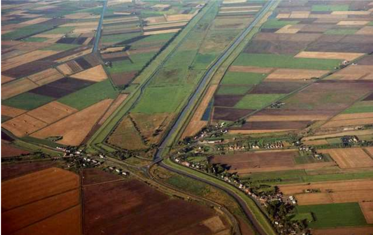
The Wash – field patterns, drainage canals and settlement (Norfolk County Council)

coastal reclamation expand greatly, aided by imported Dutch engineering knowledge, using canals, drainage channels, and sea and river embankments. The area changed from a grassland and water dominated landscape to a highly cultivated and managed arable landscape. The 18 th century saw further improvements to the drainage technologies, including the introduction of wind pumps, and subsequently steam pumps. With the drainage and reclamation small farmsteads started to appear outside of the historic belts of settlement on the former islands of higher ground, and drove ways, known as ‘The Smeeth’ were created running along the cultivated fields to the coastal marshes, as a consequence most buildings in the open, inland fen are post 1750. It was in the Fens that the phenomenon of the shrinking of moorland due to drainage was scientifically proved, with the sinking of the Holme Post into the ground and its re-emergence after drainage works in the vicinity (Fowler 1933), leading to a change in the paradigm for the occupational history of the Netherlands and hence the Wadden Sea area.