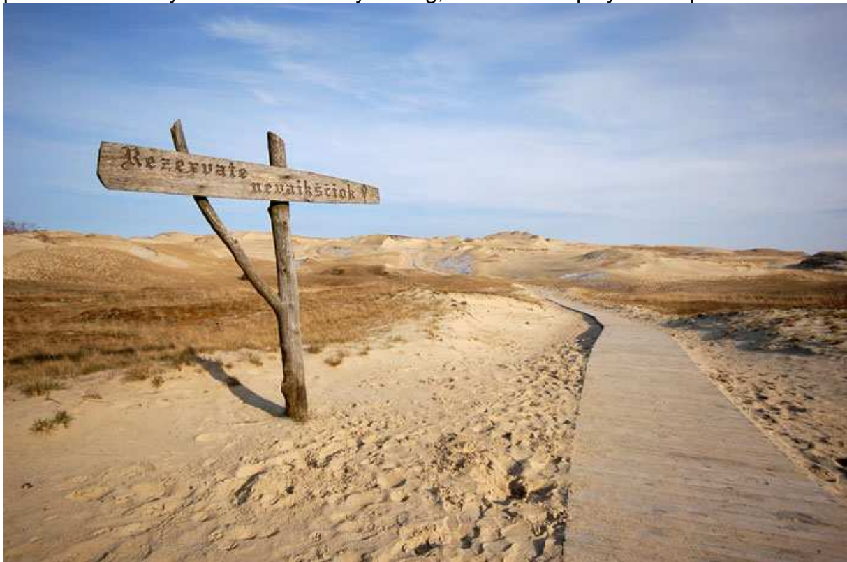
Sand-dunes on the Curonian Spit

Elongated sand-spit. The Curonian Spit stretches from the Sambian Peninsula, part of the Kaliningrad Oblast, Russia to the south to its northern tip, which is separated by a narrow strait from the port city of Klaipėda, Lithuania. The northern 52 km long stretch of the 98km long spit belongs to Lithuania, the remainder to Russia. The width of the spit varies from a minimum of 400m to a maximum of 4km. It was formed about 5,000 years ago. From c. 800 to 1016, it was the location of Kaup, a major pagan trading centre. The Teutonic Knights occupied the area in the 13th century, building the castles at Memel, Neuhausen and Rossitten. In the 16th century, a new period of dune formation began. Increasing deforestation, due to overgrazing, logging and the building of boats during the Russian siege and occupation of Königsberg and East Prussia between 1757 and 1762 led to the dunes taking over the spit and burying whole villages. In response the Prussian government in 1825 sponsored large-scale re-vegetation and reforestation projects. As a consequence, much of the spit is now covered with forests. In the 19th century the Curonian Spit was inhabited primarily by Curonians, (Kursenieki) with a significant German minority in the south and a Lithuanian minority in the north. In the past the economy was dominated by fishing, tourism now plays an important role.