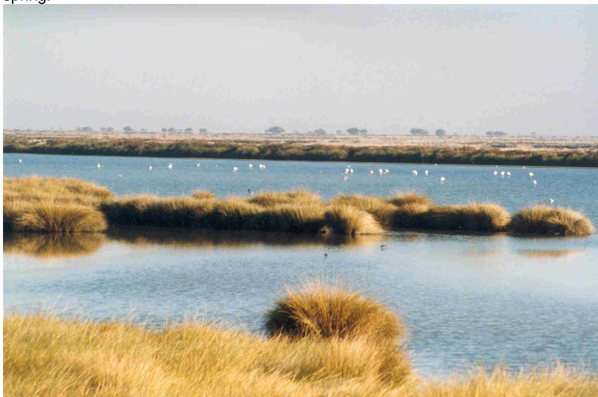
View across one of the lagoons at Doñana

A landscape of coastal marshlands and shifting sand dunes situated on quaternary deposits. Almost half the reserve area comprises swamps on flat clay soil filled with muddy sediments (marismas) with features including natural river channels, springs and pools. The marismas flood in winter creating ideal conditions for large flocks of migrating birds. Doñana has a known history of over 700 years. Since 1262 Doñana has been the favourite hunting reserve of Spanish kings - Alfonso X, Ferdinand II, Charles V, Philip II, Philip IV, Philip V and Alfonso XIII. It was granted to the Dukes of Medina Sidonia in 1300 who preserved it as a hunting park for 500 years. El Palacio de Doñana was once owned by the Duchess of Alba where she was painted by Goya. From 1737, stone pines were planted widely, but the clearance of coastal junipers later in the century destabilized the sand dunes which became increasingly mobile. Wood gathering, charcoal production, cattle-grazing, beekeeping and fish farming occur within the Park and twenty-five families, mostly park staff, live inside it. There is a religious festival at El Rocio, increasingly under the control of the Park administration to safeguard conservation, which brings large crowds of pilgrims every spring.