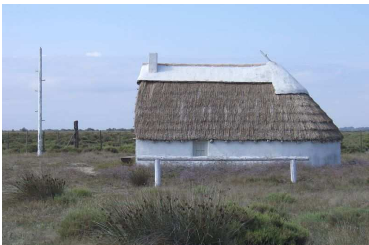
Traditional building on the Camargue, the pole at the left of the photo enabled the rancher to climb up and oversee the animals