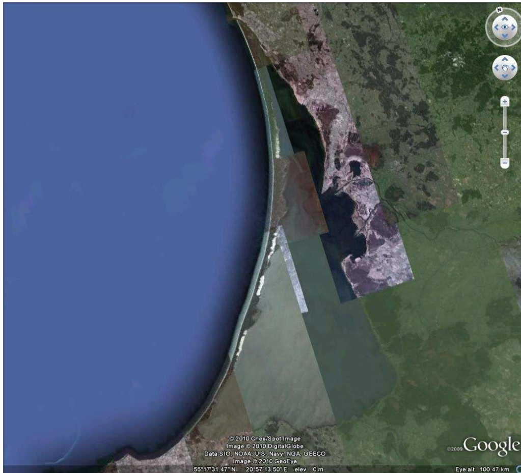
GoogleEarth image of the Curonian Spit