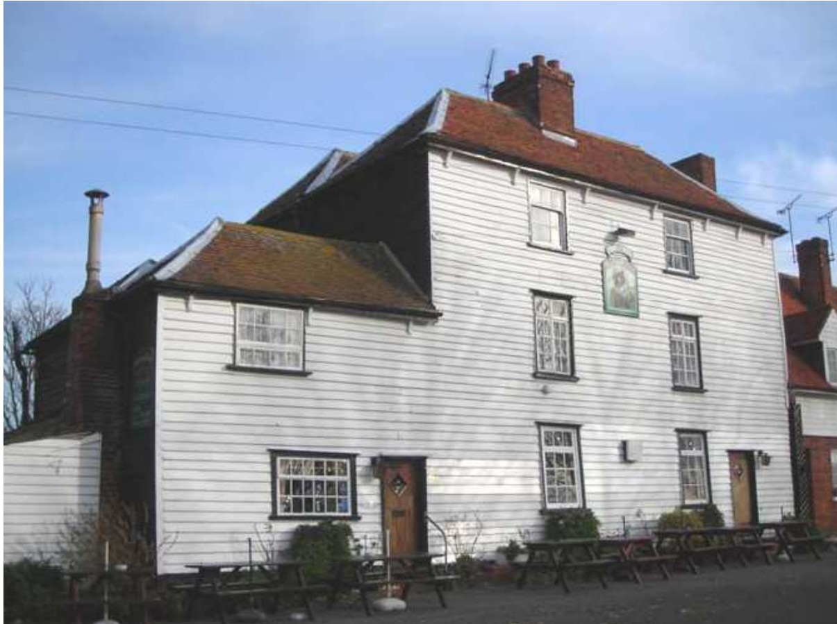
A timber framed building with plank clad exterior (known locally as weather boarding) typical of the vernacular architecture in the Greater Thames, now a pub this three storey structure was originally a sail loft.

Despite these developments much of the area remains essentially rural and until quite recently the extensive grazing marshes were largely intact. However, following the great wars of the first half of the 20th century the maximisation for food production was a high priority and supported first by national and then by EU subsidy the grazing marshes were converted to arable production. It is estimated that around 80% of the grazing marsh around the Greater Thames estuary had been lost, mainly to arable agriculture by 1980.