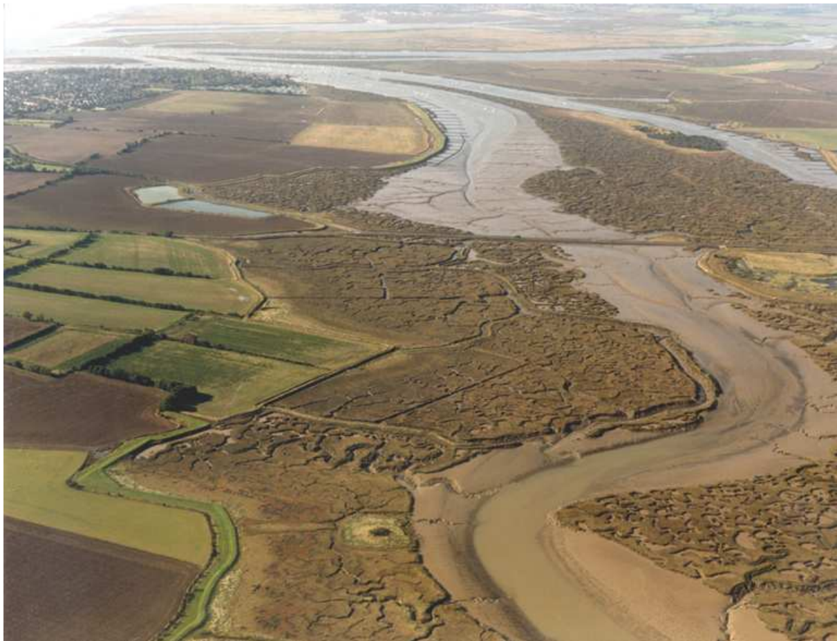
Tidal inlets, sea-walls and salt marsh in the Greater Thames estuary. The causeway in the middle distance is of Saxon origin, the low mound in the foreground is a Roman Red Hill, the enclosure around it and raised causeway leading to it reflecting later reuse probably as a stock enclosure

The Greater Thames Estuary stretches from Harwich in Essex to North Foreland in Kent and upstream to Rainham on the outskirts of London. It is a large estuarine complex with numerous creeks, extensive sand and mud flats, islands, salt-marsh, and embanked grazing marshes (now mostly converted to arable agriculture). The whole area has historically been a major zone of contact between Britain, continental Europe and the wider world.