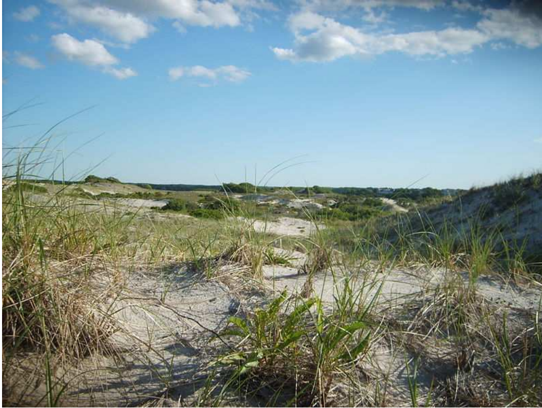
Dunes at Sandy Neck, part of the Cape Cod's barrier beach