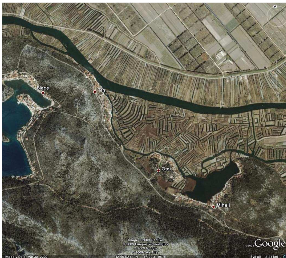
Jendecenje strips visible on GoogleEarth