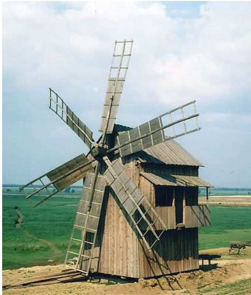
Old mill at Letea in the Danube Delta