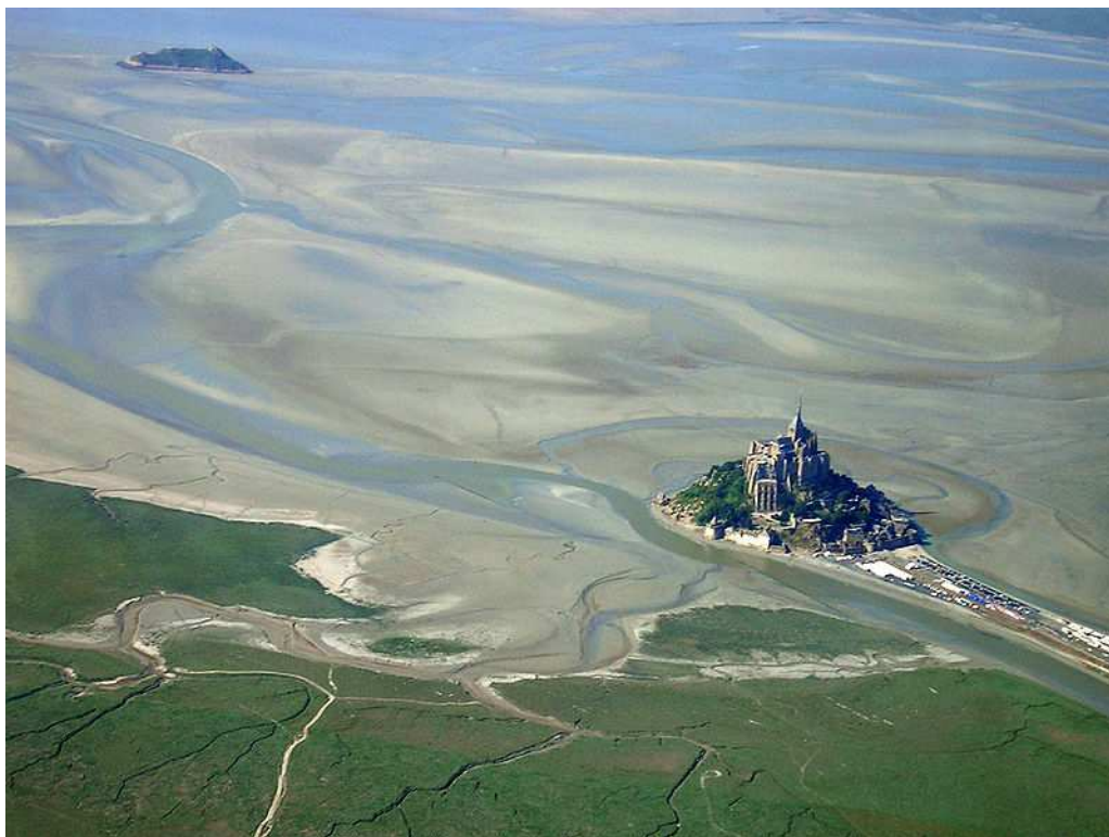
Aerial view of Mont Saint-Michel and the tidal flats

The island was previously connected to the mainland via a thin natural land-bridge which was revealed at low tide. In 1879 the land-bridge was converted into an engineered causeway with consequent effects on the silting patterns in the bay, which were compounded by the canalization of the Cousenon River. Polderisation of the marshes on the landward side of the bay created salt-marsh meadows used since the 11 th century for grazing, agneau de pré-salé (salt meadow lamb) is a local specialty. Covering 40 sq. km they are the largest salt-marshes on the French coast. The tidal-flats are an important natural resource for migratory and over-wintering birds. A project is currently underway to remove the accumulated silts and make Mont St-Michel an island again.